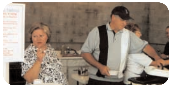
Excellent food prepared and sold by The Halifax United Church of Christ