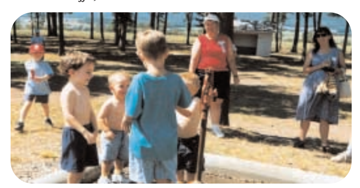
Like generations of Enders children before them, the water pump still attracts!!!