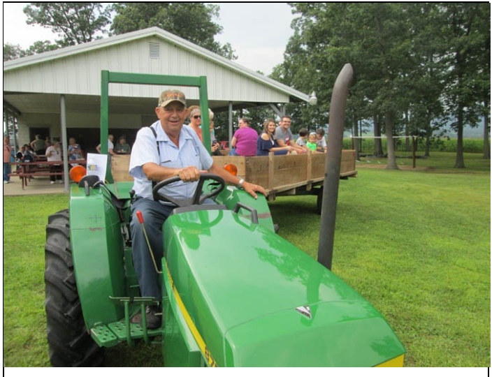
Love those hay rides!