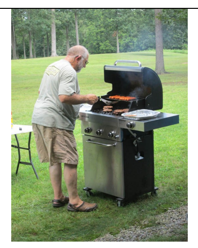
Thanks to Messiah Lutheran Church, Fisherville for providing a food stand. Delicious food, especially the desserts!