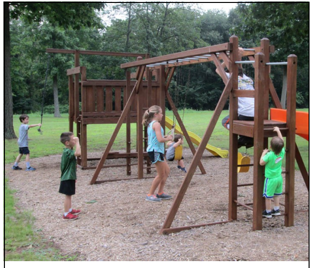
Thanks to those who spend many hours working at the Grove. Everything looks so nice. Your work is always appreciated.