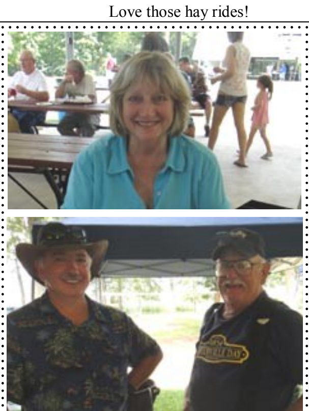
Thanks to Messiah Lutheran Church, Fisherville for providing a food stand. Delicious food! Especially the desserts!!!