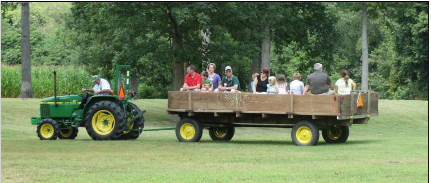
A beautiful day for a hayride which was enjoyed by many.