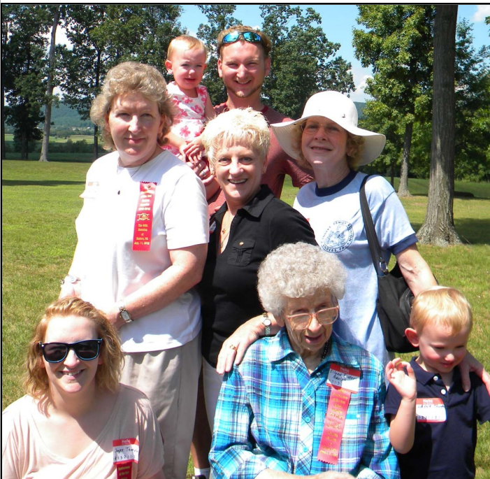
MOST CHILDREN AND GRANDCHILDREN PRESENT