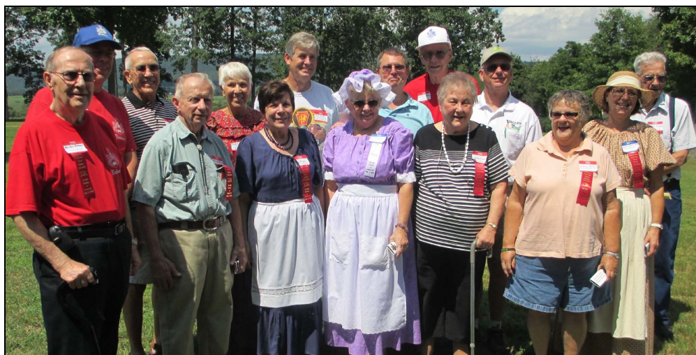
Recognizing past and present officers. Thank you for preserving our heritage for future generations.