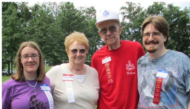
The McElheny Family