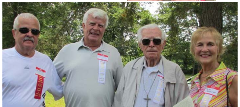
The Shearer Family