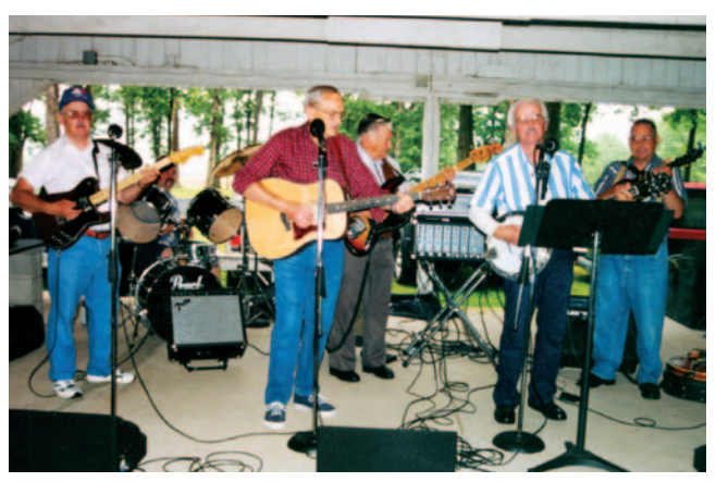
"The Country Traditions" are back for a second year by popular demand. This musical group will play from 5:00PM until 8:00PM in the auditorium. Make yourself comfortable on that easy lawn chair which you brought and drink in the melodies of "The Country Traditions".