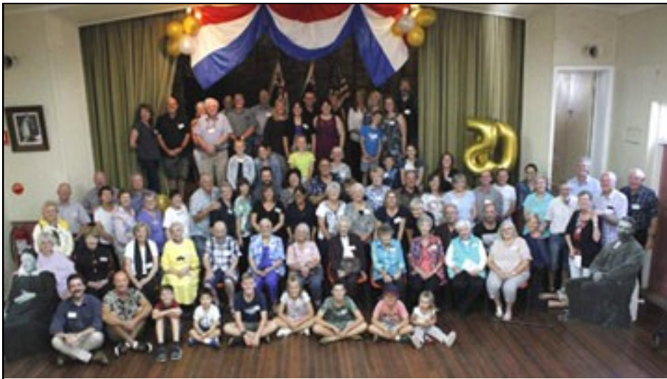
Held in Stanhope, Victoria