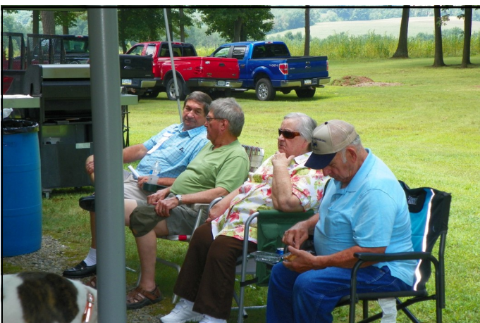
Thanks to Messiah Lutheran Church, Fisherville for providing a food stand. Delicious food, especially the desserts!