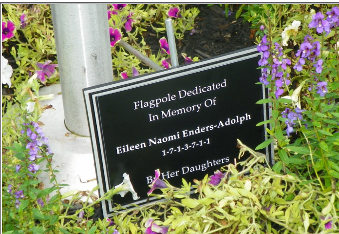
Flagpole dedicated in memory of Eileen Naomi Enders-Adolph by her daughters