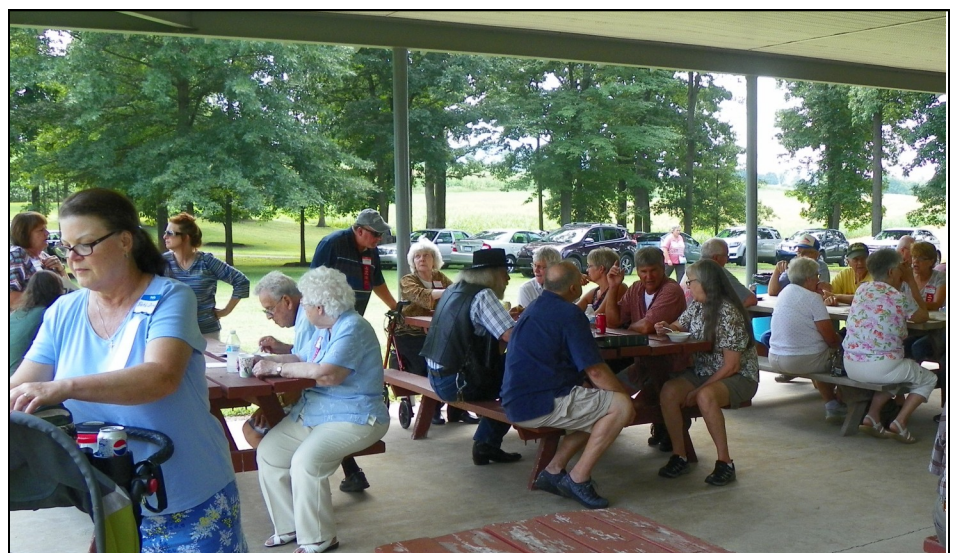
Beautiful grove, perfect weather and delicious food!