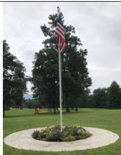
Thank you to all who helped to provide our grove with a beautiful flag pole, pavement and garden.