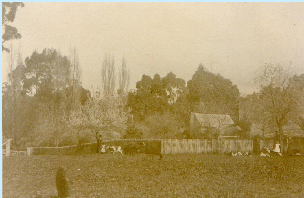
A photo taken of the rear view of the home “Musk Dell” approx 1904.