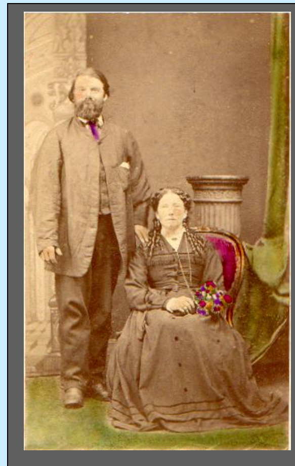
Wedding Photo taken 1855